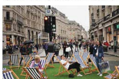
Londoners relax on deckchairs in Regent Street on World Car Free Day yesterday

By News Reporter LOCAL councils must do more to tackle air pollution, London's mayor said yesterday. Sadiq Khan spoke out as 17 miles of road in 15 London boroughs closed to traffic on World Car Free Day. Mr Khan said: "I'm frustrated by some councils being anti-walking, anti-cycling." He said City Hall was responsible for just five per cent of the capital's road network. Mr Khan said: "There are two million Londoners, 400,000 of them children, living in areas where the air quality is illegal." Schools should enjoy traffic-free zones, say parents and residents. Nearly 90 per cent of 1,000 polled by charity Sustrans wanted more street closures outside schools.