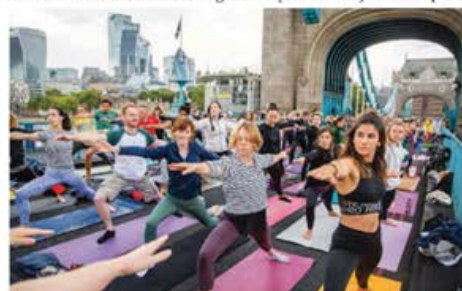
YOGA enthusiasts saw the capital go car free on a number of key routes, as part of mayor Sadiq Khan's campaign to encourage use of alternative modes of transport. The City saw a number of thoroughfares closed to motor traffic, and regional roads, among other things, a place where people played for several hours on Fenchurch Street. Khan urged more action to be taken against air pollution.

LONDON FINDS ITS ZEN Yoga aficionados replace cars with exercise mats on Tower Bridge for a quiet Sunday in the capital