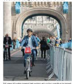
First mayor of London to launch anti-cycling campaign as he hopes to see the city's streets used for walking and cycling.

Car-free Khan tells 'anti-cycling' councils to get on their bikes